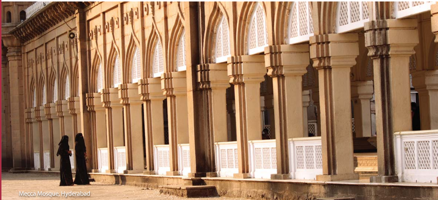
Mecca Mosque, Hyderabad