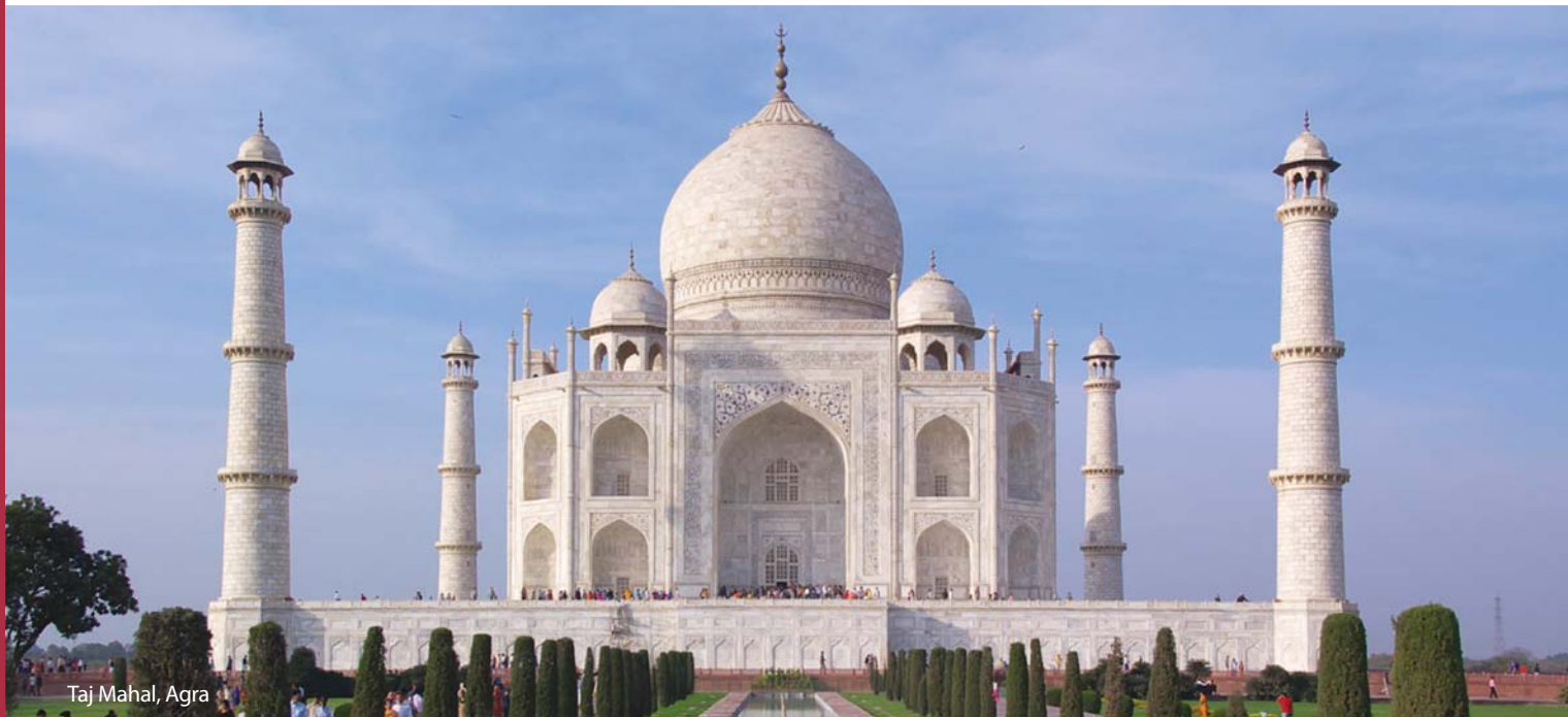
Taj Mahal, Agra