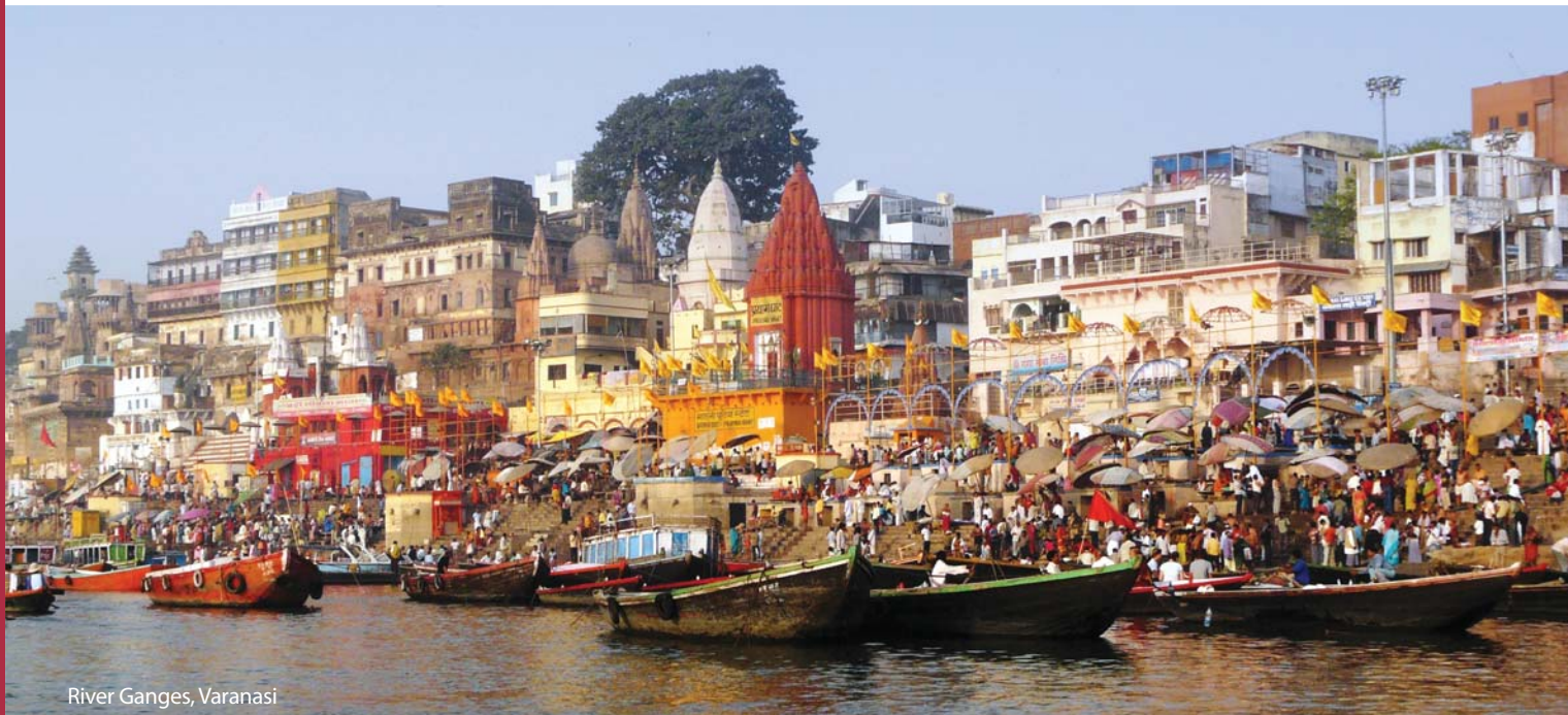
River Ganges, Varanasi