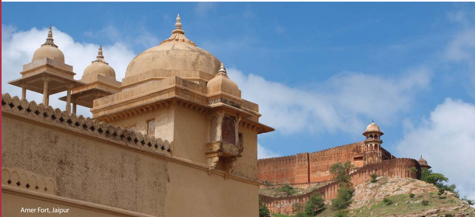
Amer Fort, Jaipur